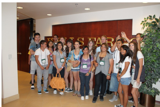
College of Business Track visits Wells Fargo

We're going to stand up and yell FOR SCIENCE!